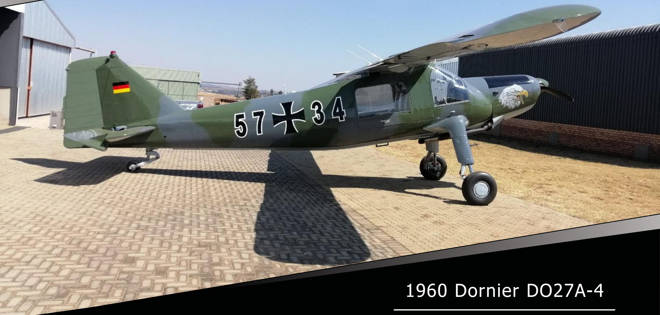
1960 Dornier DO27A-4